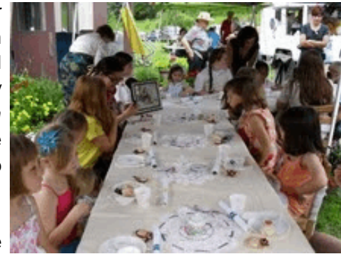
The very popular Victorian Tea