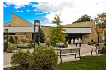
Our library was very busy in 2011

Literary exploits included participation in the UAlbany Foundation's community read—Henry James' Turn of the Screw was the topic—and a 200 th -anniversary bash for author (and BBC Masterpiece goldmine) Jane Austen that we called "Austentatious."