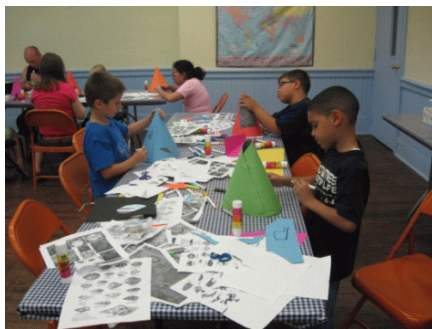
Comics Grant participants

2011 saw an across the board increase for adult programs and services offered at the Troy Public Library. Program attendance more than doubled, with over 1600 people attending programs such as our weekly computer classes, monthly Legal Clinic, and special events and workshops throughout the year. The Lansingburgh Branch offered numerous sessions of Tai Chi, Zumba and Chair Yoga during this past year as well. Other popular offerings included our Adult Summer Reading Program and Shorts Out Loud , with weekly musical and literary offerings. Use of public computers also increased significantly in 2011. And of course the Troy Room, the center of our Genealogy and Local History department, was visited by over 1,200 people in 2011.