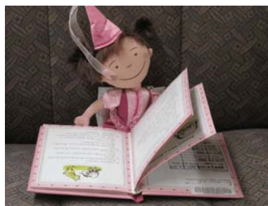
A bedtime story at the Sleepover

The Master Plan Committee received a grant from the Bender Family Foundation to hire consultants for long-range service and facility planning. This project is nearing completion. Recommendations will address the Library's need for sufficient space, its location, and its service mix.