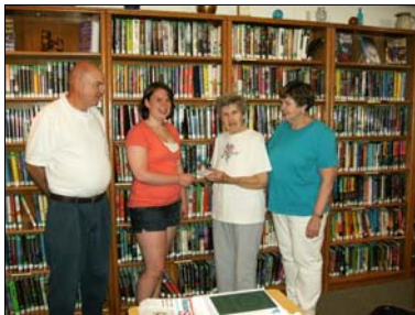
Leo Clement Scholarship winner

We started the year by reworking the hours of operation for more consistency. The library is now open six days and an additional 3.5 hours per week. Patrons were pleased with our new hours right from the start, which was one of our concerns as we made the plans.