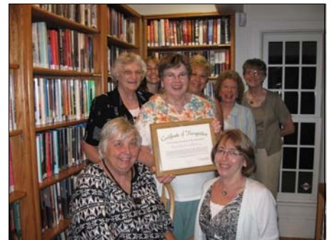
Volunteer of the Year Award winners

We were very excited to learn that the Friends of Poestenkill Library had been awarded the 2011 UHLS Volunteer of the Year Award . A group of Friends boarded the Capt. JP boat for last year's Annual Dinner to accept the award. The Friends of Poestenkill Library play a key part in the success of the library. The library budget starts each year with a gap of $15,000 between anticipated expenses and anticipated income. That gap equals the amount of the materials budget. Through the fundraising efforts of the Friends, and through generous donations by patrons, we have managed to meet that gap every year. The Spring and Fall Market Days sponsored by the Friends and their very successful annual Holiday Lights Appeal raise the money to help make ends meet. The Friends are really the key to Poestenkill Library's success.