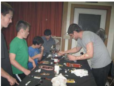
Applying Zombie make-up

In addition to the grant projects, we had on-going programs including Storytime, Family Movie Night, Adult Game Night, Book Club, and outreach programs at the schools. The library hosted a total of 145 programs during 2011. The library also participated in community events whenever possible