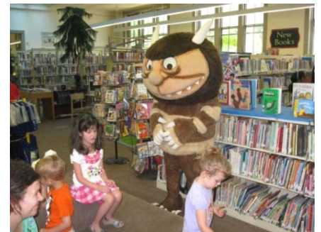
More programs than ever before...

from last year. We provided more programs to more children and families than ever before. During the summer our program attendance by children nearly doubled.