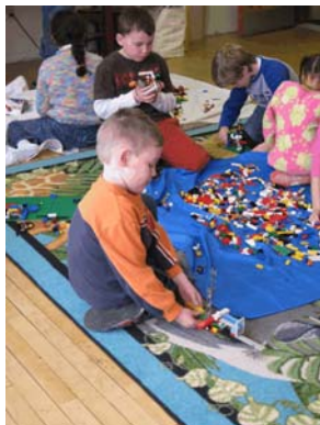
The construction zone

A third Librarian joined the staff in May. He continued the Library's public facelift with website, Facebook, Google+, and Twitter communications. He also regularly presented technology-instruction programs that attract many adults. People often stopped in for help using newly acquired eReaders. Staff now orders eTitles every month. Statistical reporting has been revamped to include electronic media.