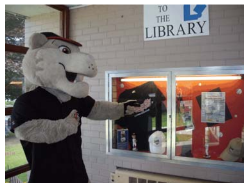
"Southpaw" came for a visit.

Our children's room continues to be a very active meeting place for children of all ages. We have several literacy tutors and community groups that use the children's room for meetings and special programs. Several school groups toured the library in 2011 and received their first library cards. We had over 120 children participate in our Summer Reading Program. The Summer Reading Program was kicked off by a visit from Southpaw, the mascot of the Valley Cats. Players from the team read to the children and answered questions about playing professional baseball. Our Teen Summer Reading Program had a small but dedicated group of readers who wrote book reviews to encourage other teens to read. We hope to reach even more children in 2012 by continuing our efforts to reach out to local elementary schools to keep children reading all year long.