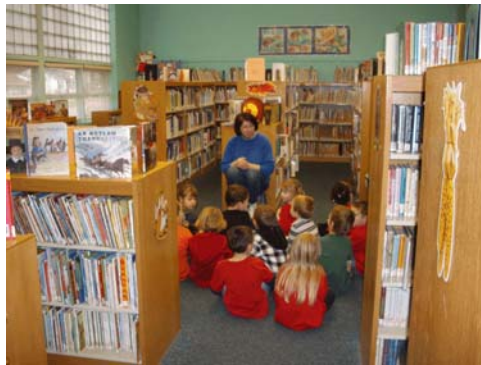
Our children's room is an active meeting space.

Our Town is generous in its support of the library and our dedicated staff and volunteers continue to provide valuable service. Volunteers provided many hours of service to the library allowing the staff to serve the public more efficiently. Our volunteers perform routine duties such as shelving books, book repair, and carry out many small time-consuming projects during the year. Also, our Friends group works tirelessly for the improvement of the library through their on-going book sale. The Friends' efforts in 2011 enabled the library to purchase new shelving for our collections and many new talking books and DVDs.