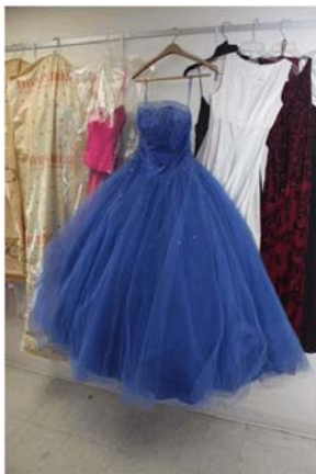
Collecting for the Cinderella Project

The Voorheesville Public library served as a hub of learning. Young people – babies through high school students – used the library for Babygarten, Toddler Town, story hours, book discussions, arts performances and programs for exploring new topics. Parents used library space for Odyssey of the Mind rehearsals, Boy Scout and Girl Scout meetings, and coaching sessions. Adults came to discuss books, to delve into the American Civil War, to sew, to go on fascinating field trips, and to learn how to use eReaders. Booklovers, readers, researchers, students, and community members of all ages explored our resources.