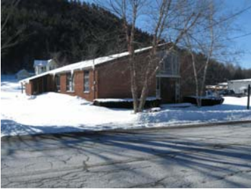
The Library's future home

After twenty years of searching, a location was found that meets the needs and budget of the Berne Public Library. The Town of Berne purchased the recently decommissioned St. Bernadette's Catholic Church in Berne on November 11, 2011 for use by the library and offices. We are very excited about this upcoming move. The property even has a parking lot.