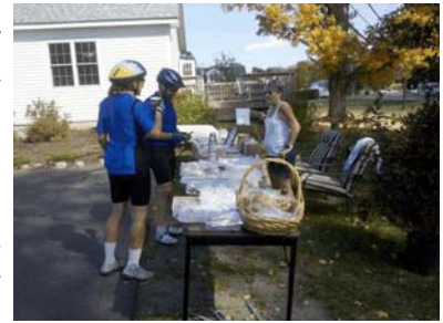
At the Library's Plant Sale

Stephentown Memorial Library soared to new heights in 2011. The year began with the formation of the Friends of the Library. This has been a long-time dream at SML. Under the guidance of dedicated Board members, the group emerged in January 2011 and charged forward with determination. They focused on fundraising, making over $7,000 with several great events, including Bake Sales, Soup and Subs Sale, Holiday Pie Sale and more. This group is small, but mighty and they are great cooks. The Friends jokingly refer to SML as “the library built on cookies.” Another initiative was the formation of a Small Business Group to bring local entrepreneurs, artisans, and home-based businesses together and provide them with a way to exchange ideas, and work together. This cooperative spirit led the group to merge with a similar group in New Lebanon.