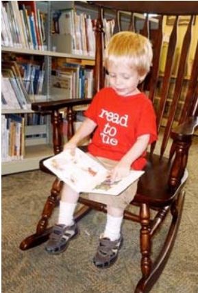
"Read to me" at the Library

The Rensselaer Public Library serves as a community center for lifelong learning and provides services and materials in a safe and positive environment to meet the informational, educational, cultural and recreational needs of the City of Rensselaer, NY and its surrounding area.