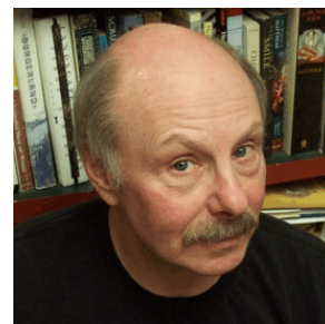
James Howard Kunstler