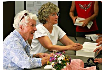
Jean Craighead George

Perhaps the most notable guest of honor at the Festival was Newbury Award-winning author of more than 100 books, Jean Craighead George, who was treated to a staged reading of her work, directed and performed by lovers of her fiction and volunteers from the Library. This free event brought visitors from far and wide to revel in her presence and to honor