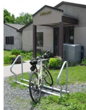
New bike rack from CDTA