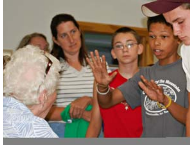
Jean Craighead George and fans