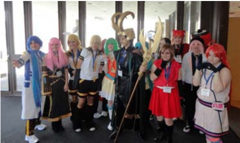
The Anime Club

The Watervliet Public Library saw a lot of growth and many changes in 2011! The Summer Reading Program was the most successful ever with over 300 participants, great partnerships with local schools and summer camps, and a huge End-of-Summer Carnivale. A family environment has taken over at the library and kids of all ages are welcome as we now offer crafts, story times and events for children. A grant from NYSED enabled us to start a Young Adult collection with teen fiction, graphic novels, audio books and ebooks. We also more than tripled our teen programming by offering events such as Anime Club, teen crafts, teen movies and a teen book club that partners with our local high school teachers. Many teens and even the principal attended some of these events.