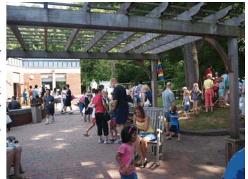
Family Fun Day at the Library

We held 837 programs attended by 22,657 patrons in 2010/2011.