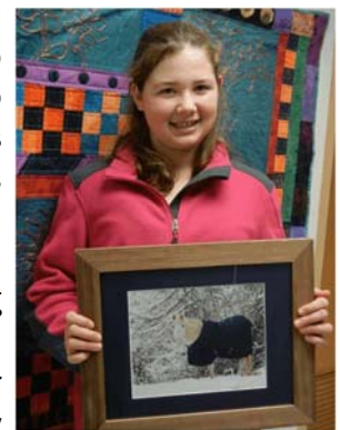
Student Art Contest winner

This year we added 7,976 items to our collection, including more than 300 eBooks. We offered 427 library programs – including the Summer Reading Program – that reached over 9,300 people and we provided space for 173 community meetings.