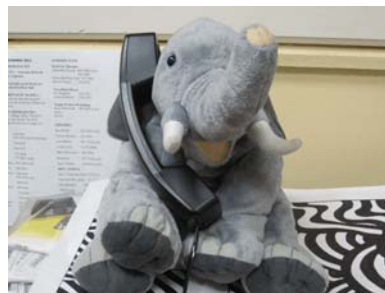
Calling for pizza at the Sleepover

the Library produced successful Fun Fairs for the Very Young at both elementary schools. Two new children's programs in addition to the Lego®-driven Construction Zone were wildly successful – the Band Instrument Petting Zoo and the Stuffed Animal Sleepover.