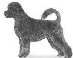
Portugese Water Dog