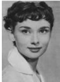
Audrey Hepburn in "Roman Holiday"

and has been chosen in honor of the Bicentennial of the Town of Guilderland. Several area "celebrities" will provide a complete reading of this wonderful book. Thursday, May 22, 2003 at 7:00 PM.