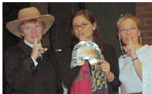
Not your typical librarians...