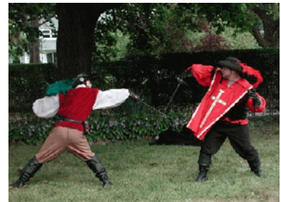
Sword fighting demos are part of the Once Upon a Time program

MEDIEVAL FAIRE YARD PARTY - Come to the Faire! Live demonstration of sword fighting by medieval re-enactors. Saturday, July 10 from 2:00 - 4:00 PM.