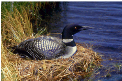
The Common Loon